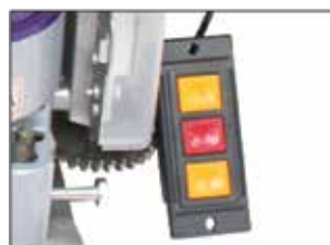
SHUTTER MOTOR SWITCH